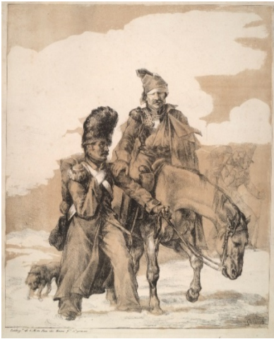
Retour de Russie (Return from Russia), 1818, Théodore Géricault Lithograph w. tint stone, 17-1/2 x 14-1/4 in

A Frank Encampment in the Desert of Mount Sinai (1842), a water color by John Frederick Lewis, is an example of stylized and idealized encounters between the West and the Orient. A confident Sheik Hussein greets the lounging British Viscount Castlereagh in his tent. Lewis lived in Egypt for 10 years and understood social status in Islamic society. His depiction of the Sheik as an independent dominating figure standing over an English Lord was so offensive to British cultural superiority that Lord Castlereagh rejected the watercolor he had commissioned Lewis to complete.