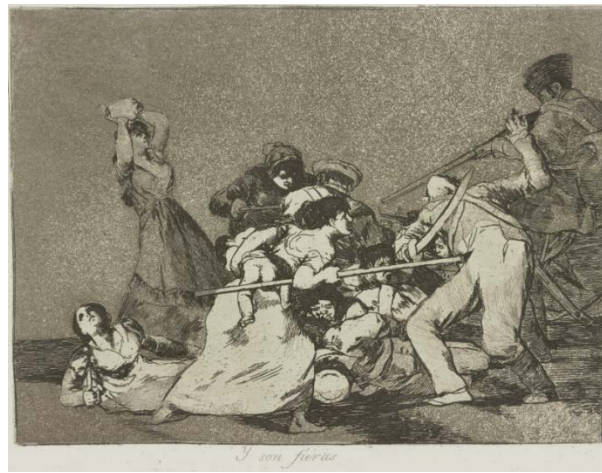
Y son fieras (And they are like wild beasts) ca. 1810-20, Francisco Goya Etching and aquatint, 6-1/8 x 8-1/4 in