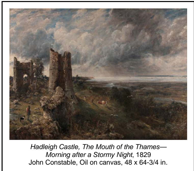
Hadleigh Castle, The Mouth of the Thames—Morning after a Stormy Night , 1829 John Constable, Oil on canvas, 48 x 64-3/4 in.

The next theme, Landscape and the Perceiving Subject , traced the move away from using landscapes to show heroic or mythical human actions. Landscapes that focused on nature and the interaction of artist with natural forces evolved, as did landscape tourism.