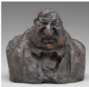
Jean-Marie Fruchard: Disgust Personified , ca. 1833, Honoré Daumier, Bronze, 4-3/4 x 5-1/8 x 4 inches

The declining nobility and the rising bourgeoisie were not immune to artistic criticism: Honore Daumier's 1833 bronze bust of Jean-Marie Fruchard and his 1834 lithograph of a police massacre in Paris were considered scandalous caricatures and exposés of the monarchy of King Louis-Philippe. The reluctance of the nobility to share power with urban masses fueled the 1848 popular uprisings in France, Italy, Germany, and Austria, which were ruthlessly suppressed by reactionaries in the same year.