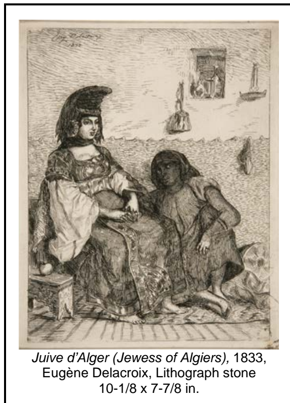
Juive d'Alger (Jewess of Algiers) , 1833, Eugène Delacroix, Lithograph stone 10-1/8 x 7-7/8 in.

During the expansion of European colonialism, the art world reflected the Western fascination with exotic cultures as shown in the theme Distant Lands, Foreign Peoples . The cultural arrogance and ethnocentrism of Western Europe is best illustrated by exaggerated or fictionalized artworks of scenes and subjects from Orientalism, which at that time included Greece, Turkey, the Middle East, and North Africa. Detailed drawings, water colors and paintings of people and scenes that only existed in the minds of European artists proliferated and were consumed by viewers anxious to experience a culture