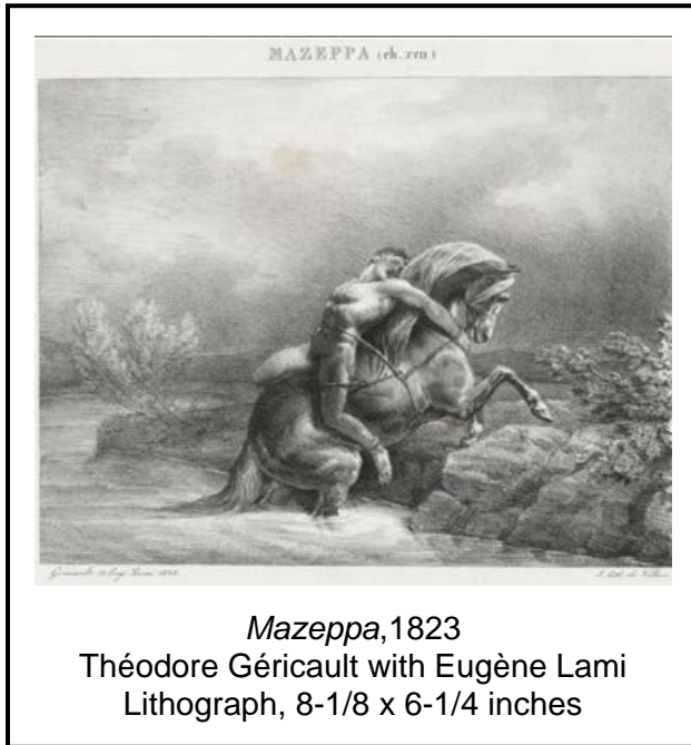
Mazeppa , 1823

The lengthy Napoleonic Wars (1803-15) support the theme of the Artist as Social Critic . Newspapers, magazines, gazettes, and pamphlets described the horrors of war and other social ills, but only artists and illustrators could visually document the excesses and brutalities in Spain and Russia inflicted by the French armies. Théodore Géricault's Return from Russia (1818) and Francisco Goya's And They Are Like Wild Beasts (1810-20) depicted the pain and suffering French soldiers experienced in Russia and the same horrors they inflicted on the population during their invasion of Spain.