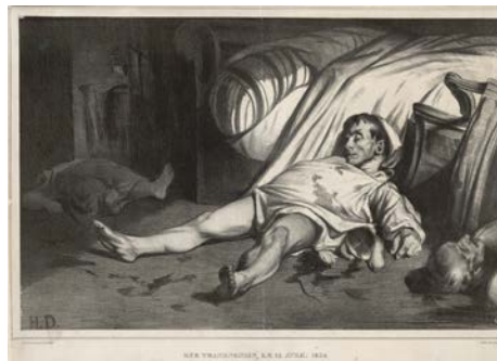
Rue Transnonain, le 15 avril 1834 , Honoré Daumier, Lithograph, 13-3/8 x 18-5/16 inches