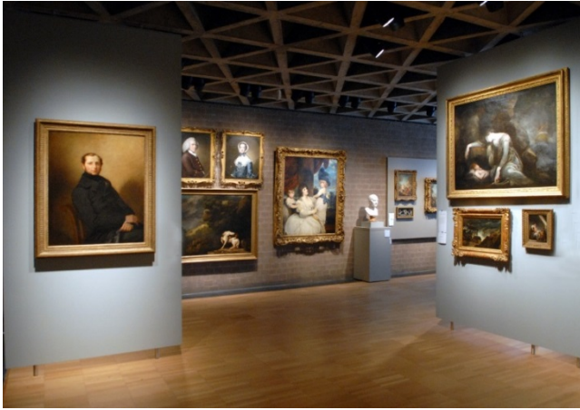
Exhibition view at the Yale University Art Gallery