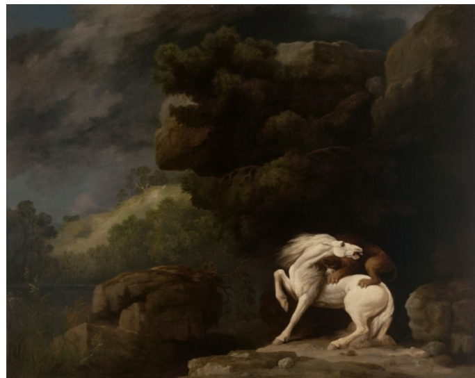
A Lion Attacking a Horse, 1770 George Stubbs, Oil on canvas, 47 x 57 in.