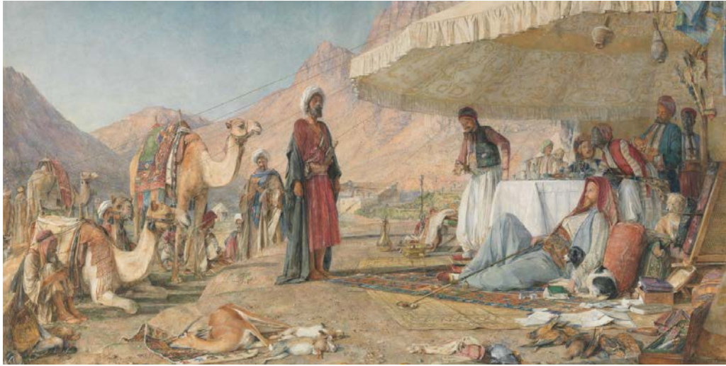
A Frank Encampment in the Desert of Mount Sinai. 1842— The Convent of St. Catherine in the Distance, 1856, John Frederick Lewis Watercolor, gouache, and graphite on paper, 26-1/4 x 53-1/2 in.

superior Western societies provided opportunities for females to participate in refined domestic arts and other intellectual interests, providing the end results were used to entertain family and friends.