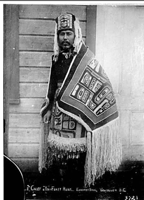
Figure 2: Nass Indian Chief in Feast Robe, 1902 6

The grade 7 lessons in Nationhood/Neighbourhood take on the concepts of exclusion and community-building. Students study both exclusion and activism, as they consider how groups both “fit in” and also “keep out” in order to create both “in” and “out” groups. This is an extremely relevant study for students at a grade level at which bullying and social exclusion are regular parts of social life and an ongoing challenge to students and teachers. The original welcoming stance of the Canadian government towards the Doukhobors from the Soviet Union shifted on divergent cultural norms about the education of children, and a high profile unsolved death in the community. Members of the Doukhobor community in Canada staged many protests (see Figure 3) during this period. The case of the Doukhobors, while a study in that culture, also allows for