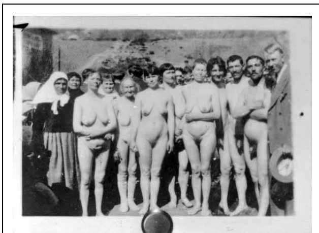
Figure 3: Doukhobor Protest, British Columbia, 1908 7

students to examine protest cultures in general. Under what conditions can communities protest against perceived injustices? What kinds of protests? How are internal conflicts within the group managed?