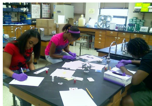
Figure 2. Students working on DNA samples provide a counternarrative to dominant imagery of White and male scientists.

For this activity, students tested four synthetic blood samples to identify the ABO and Rh blood types (see Figure 2). This activity introduced students to different blood types and how blood types are inherited. To reinforce students' knowledge and to show cultural relevance, students identified and researched a selected blood disorder or condition (i.e., thrombosis and sickle cell). Engaging in scientific inquiry, the product of this assignment was a PowerPoint Presentation® which included: 1) causes; 2) diagnosis; 3) symptoms and complications; 4) data and statistics with a special focus on how it relates to African American populations; 5) tips for healthy living (again with a focus on the cultural relevance); and 6) the cost to society.